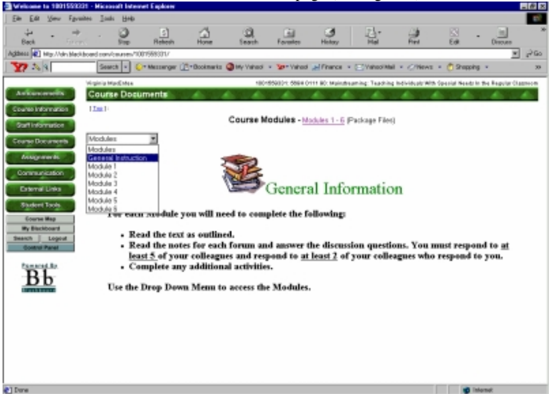
Figure 2 Dynamic course with drop down menus

The purpose of this workshop is to teach professors how to create a "one click" to all information course. This workshop will demonstrate and teach professors on how to create a dynamic course in Blackboard (see Figure 2). The workshop will teach professors how to create drop down menus and how to create lecture notes with outlines on the side of the page (see Figure 3).