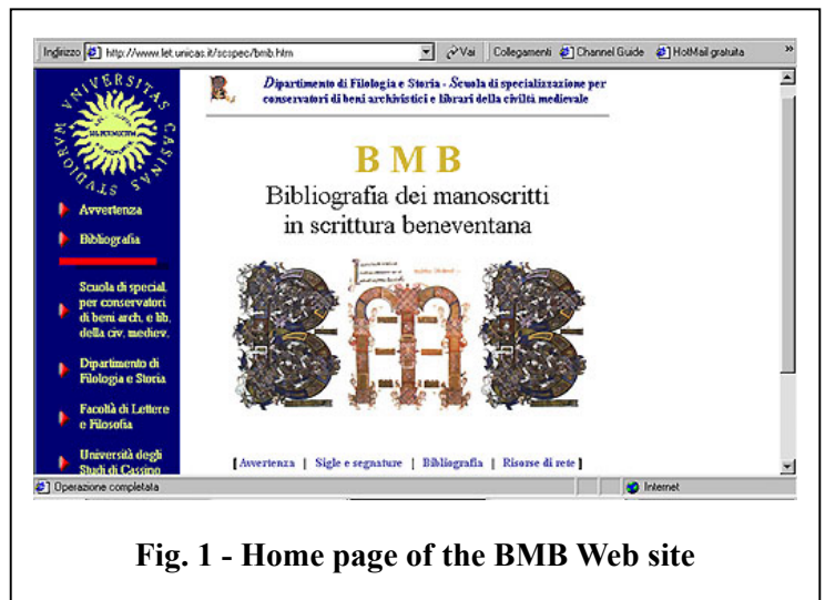
Fig. 1 - Home page of the BMB Web site

The site is today a powerful resource for Middle Ages scholars (Fig. 1 shows a picture of the home page) who can get fresh information on publications relating to literature, art, history, script (it is accessible on line at: http://www.let.unicas.it/scspec/bmb.htm ).