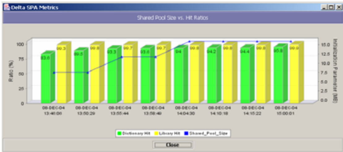
Figure 2: Library/Dictionary Hit Ratio – Medium Workload

Medium Workload results, as illustrated in Table 4, show that bigger values for both initialization parameters: shared pool area size (SPA) and buffer cache (CACHE), were required to achieve optimal/peak database workload performance. In case of buffer cache ratio a CACHE size was increased from 4 to 8 MB achieving 99.4 %; dictionary hit ratio achieving 95.8% with 16 MB, and a peak performance for library hit ratio (99.9%) with 16 MB (Figure 2).