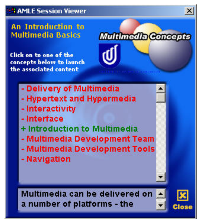
Figure 2: Session Viewer

courses, instructional objects, concepts and examples. Concepts can be either declarative or practical in nature. In a standard form of delivery, instructor organized groupings of content or sessions within the domain model (Figure 2) with their linked practical concepts, are presented to students. These sessions or groupings constitute a week's worth of work and are considered instructional objects; their aggregation and ordering have instructional significance.